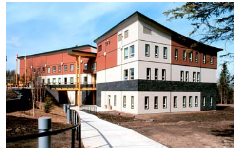
Hinton Government Centre, Hinton