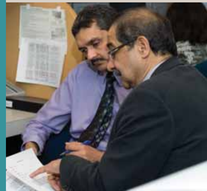
Calgary Emergency Management works with more than 30 partner agencies.

The plan's strength lies in Calgary Emergency Management's partnership with more than 30 agency members, all working with clearly defined roles and responsibilities.